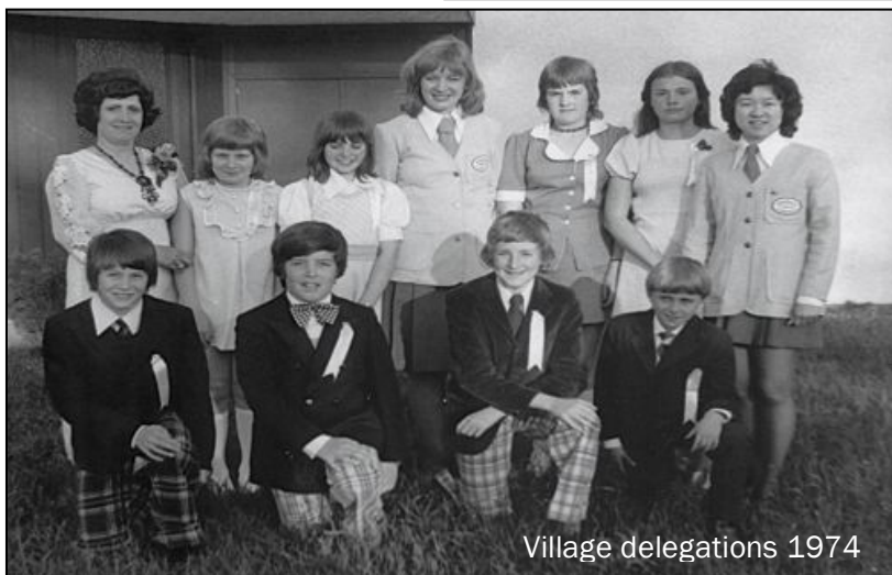
Village delegations 1974