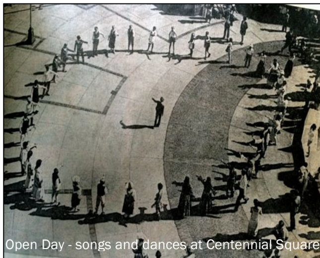
Open Day - songs and dances at Centennial Square