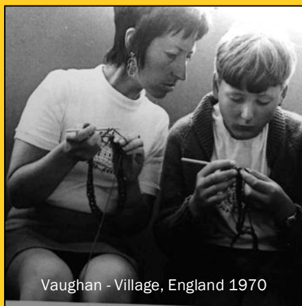
Vaughan - Village, England 1970

Canada Helps - Donations can be directed to Camp Hosting costs, Chapter needs, or the Participant Bursary Fund.