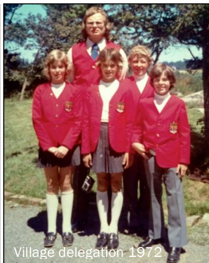
Village delegation 1972

As an international organization the success of CISV is through its membership and volunteers.